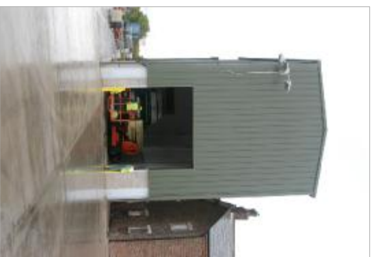
AS BUILT PHOTOGRAPH